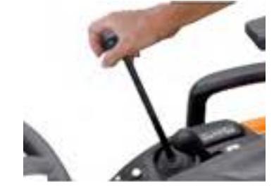
Step 3: Use the loader lever to remove the loader frame from the mast. Turn off the engine and move the loader joystick lever to relieve the hydraulic pressure.