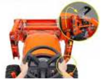
Step 4: Pull one lever to quickly and easily detach the hydraulic lines as a unit and store the coupler on the loader boom.