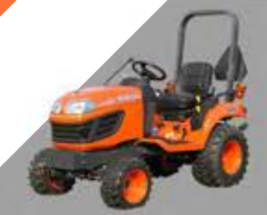
BX60 / BX25 2009 BX60 introduces a higher horsepower model within the BX Series.

BX30 / BX23 2004 Kubota expands the offering of the sub-compact by introducing the BX30 Series and the first TLB model.