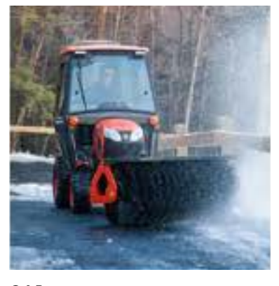
CAB (Snow Broom Shown)