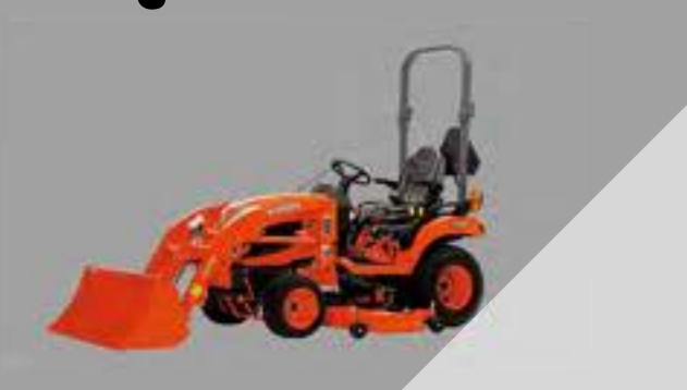
BX70 / BX25D 2015