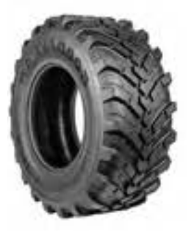
R4 INDUSTRIAL (BX2380, BX2680, BX23S only)