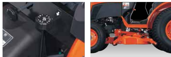
Cutting Height Adjustment Dial Suspended Mower Deck