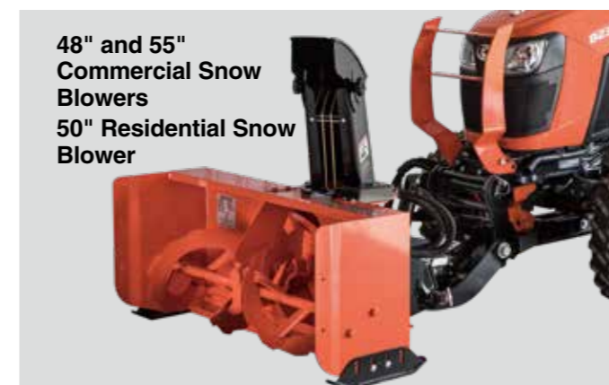
48" and 55" Commercial Snow Blowers 50" Residential Snow Blower