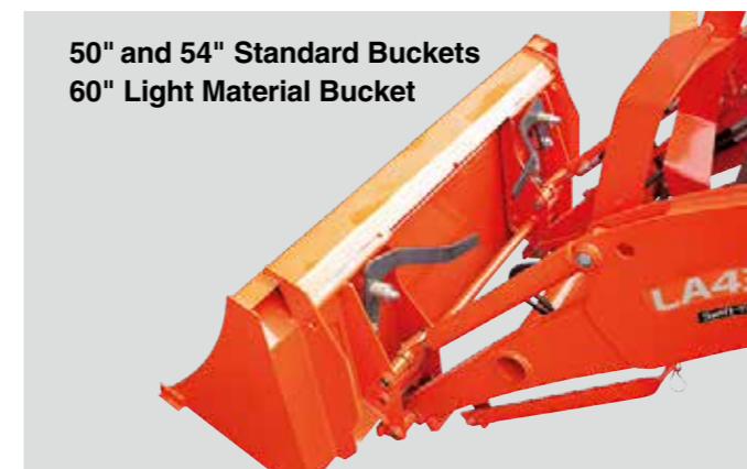
50" and 54" Standard Buckets 60" Light Material Bucket