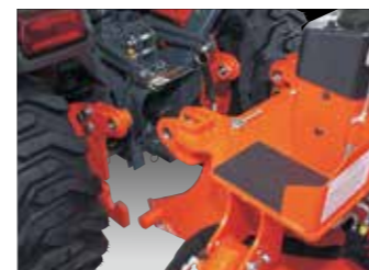
4-point Quick-Attach System