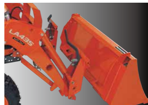
2-Lever Quick Coupler (Optional)