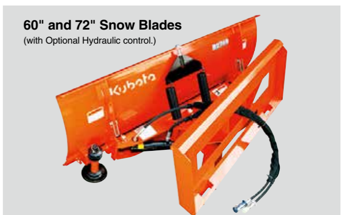
60" and 72" Snow Blades (with Optional Hydraulic control.)