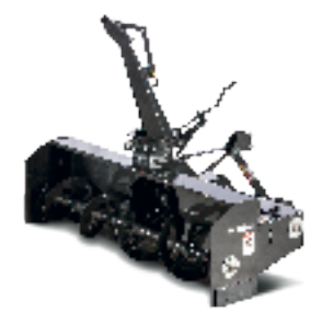
3 pt. snowblower