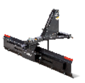
3 pt. angle blade