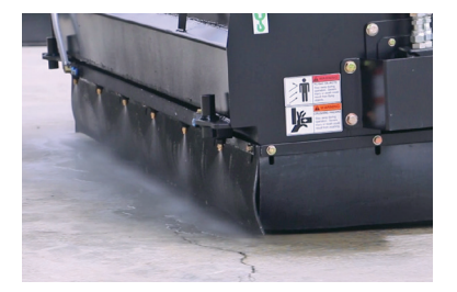
WATER KIT RUNNING