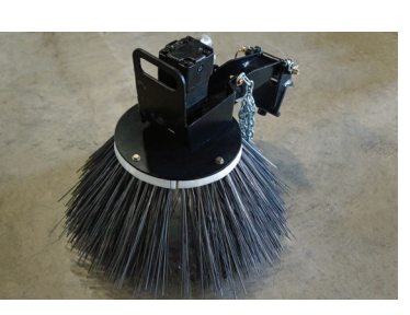
OPTIONAL GUTTER BRUSH