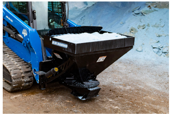
18 cu/ft Shown above