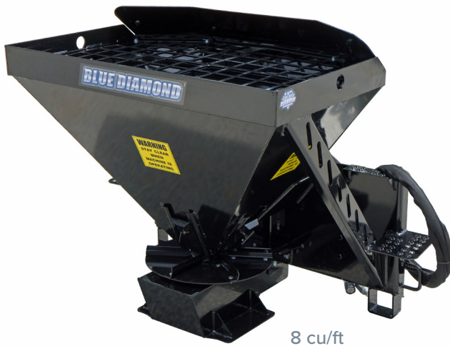
8 cu/ft Shown above