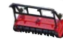
RK8620 Mulching Head