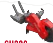
SH300 Stump Grinder

OSCILLATING UNDERCARRIAGE 30" METAL TRACK MACHINE