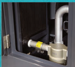
Integrated After Cooler