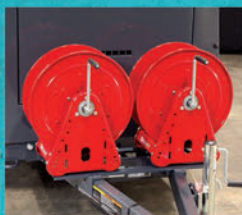
Double Hose Reel Kit