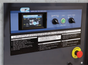
1 | Digital Touch Screen Control with Start Button & Pressure Selector Switch