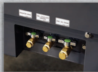
12 | Exterior Service Drains Quick drain valves for the Radiator, Oil Cooler and Engine Oil fluids