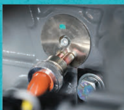
Engine Block Heater