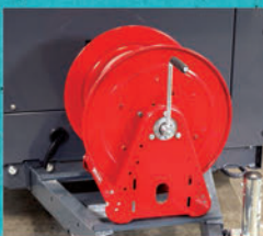
Single Hose Reel Kit