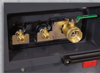
3 | Air Connections 3/4" Ball Valve x 2 | 2" Ball Valve x 1