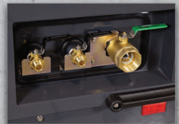
3 | Air Connections 3/4" Ball Valve x 2 | 2" Ball Valve x 1