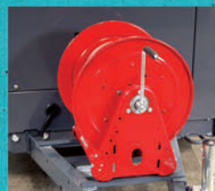
Single Hose Reel Kit