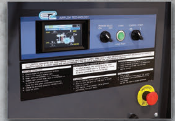
1 | Digital Touch Screen Control with Start Button & Pressure Selector Switch