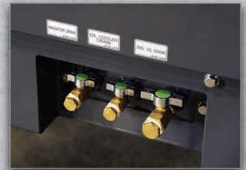
12 | Exterior Service Drains Quick drain valves for the Radiator, Oil Cooler and Engine Oil fluids