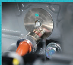
Engine Block Heater