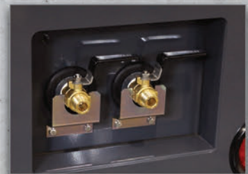
2 | Air Connections 3/4" Male Ball Valve x 2