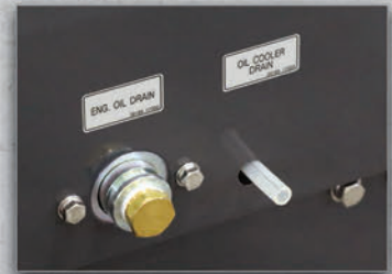
11 | Exterior Service Drains Quick drain valves for Engine Oil and Oil Cooler fluids