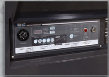
1 | Keyed Start and Digital Monitor with Auto Idle Mode