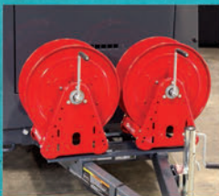
Double Hose Reel Kit