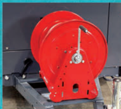
Single Hose Reel Kit