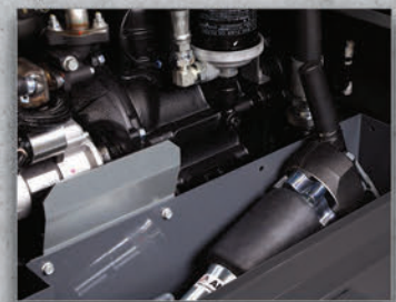
6 | Interior Storage Compartment Holds a 90# breaker or other air tools

BEST-IN-CLASS POWER TRANSFER // FUEL EFFICIENCY // dBA RATING THE INDUSTRY'S HIGHEST-QUALITY MOBILE AIR COMPRESSORS