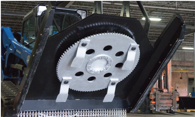
500 LB BLADE CARRIER